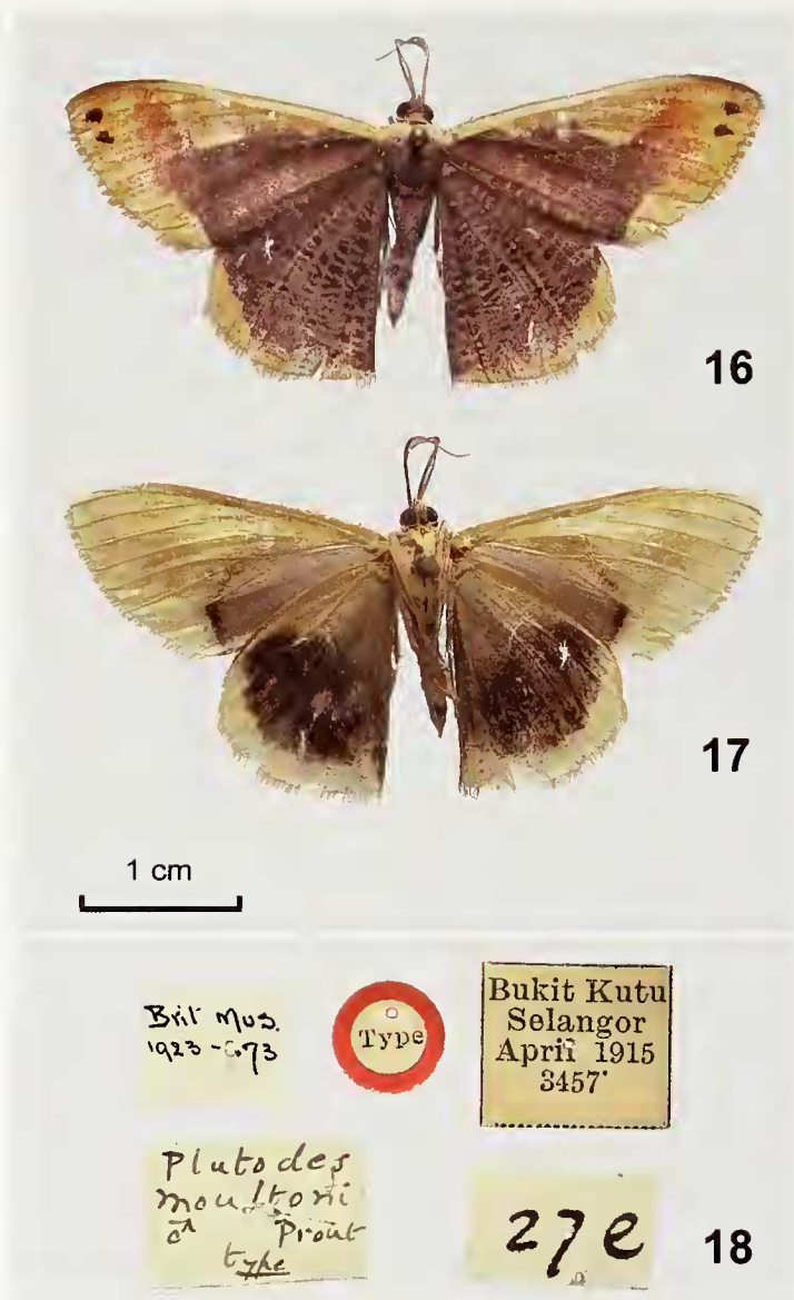
Figs 16–18. Holotype ♂ of Plutodes moultoni Prout, 1923. 16: upper side; 17: underside, 18: labels.

la a triangular, curved, cap-like plate, its tip pointing distally, with a pair of short, narrow processes arising from the proximal corners and directed caudally. Juxta a round plate, with a v-shaped incision with irregular margins dorsally. Saccus narrow, strongly elongate, rounded distally. The aedeagus straight, club-shaped, with a stout proximal and a narrow distal half, the vesica with an elongate, semi-cylindrical sclerotization and a small group of cornuti, a long, curved, distal one and 3–4 distinctly smaller ones, arising from a common base. Bulbus ejaculatorius moderately large, about half the length of the aedeagus.